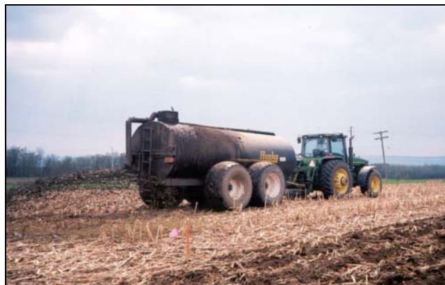
Figure 2: Surface application of manure without incorporation will result in the loss of inorganic N from the manure.